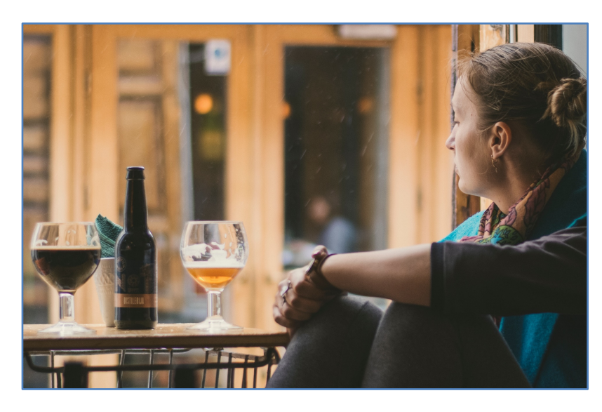
No brand names or trademarks should be visible – especially if there is any chance that the company might feel negatively about your film